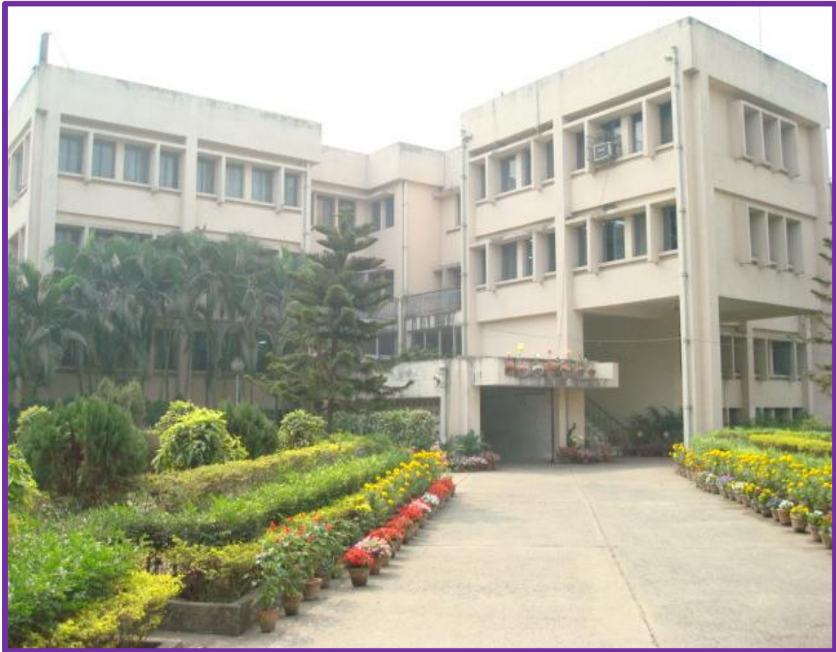
Fig:Front View of the Kolkata Centre

The Kolkata Regional Centre was established in the year 1958. It is one of the seven centres of Soil and Land Use Survey Organisation a subordinate office of the Department of Agriculture, Cooperation & Farmers' Welfare, Ministry of Agriculture & Farmers' Welfare, Govt. of India. The centre is located in the E-Block, Baishnabghata - Patuli Township, Kolkata - 700 094 on the Garia Connector of Eastern Metropolitan Bypass near Garia junction of the South Calcutta. The centre has three storied building with a courtyard. Soil Survey Officer's room, administrative section and also cartographic laboratory is situated in the first floor. The basement is the garage for office vehicles. In the second floor, a well equipped soil analytical laboratory is situated along with the field section. Remote sensing & GIS Laboratory along with Library are situated in the top floor.