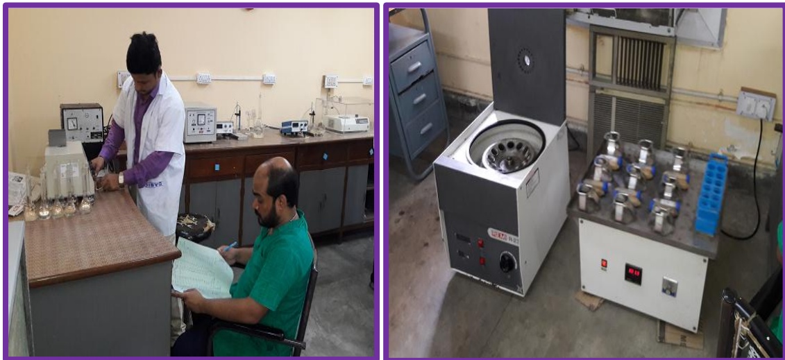
Fig: SOIL LABORATORY