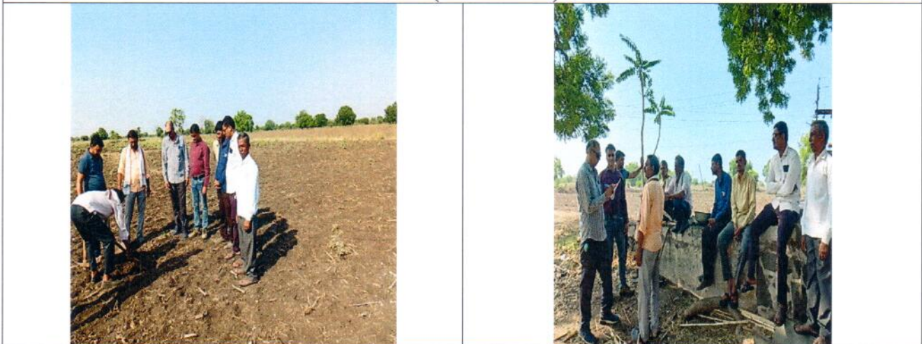
Sakare village, Dharangaontaluka, Jalgaon district, Maharashtra- SLUSI (Ahmedabad)