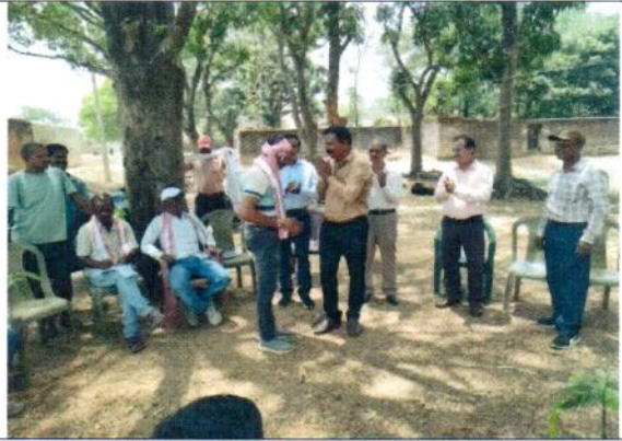
Khatinga village, Kanke block, Ranchi district, Jharkhand- SLUSI (Ranchi)