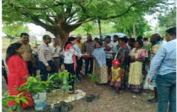
Pandra village, Ratu block, Ranchi district, Jharkhand- SLUSI (Ranchi)