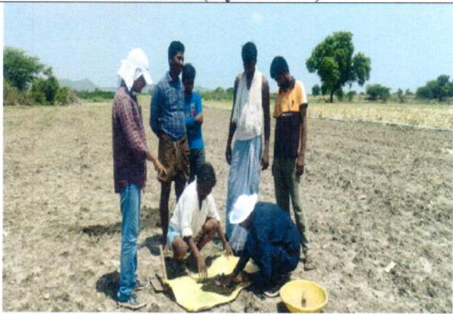
T. Thimmapuram village, Tadipatrimandal, Anantapur district, Andhra Pradesh- SLUSI (Hyderabad)