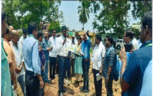
Gopalapuram Village, Hessaraghatta Gram Panchayat, Bangalore district, Karnataka- SLUSI (Bengaluru)