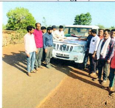
Ratangad village, Lateri tehsil, Vidisha district, Maharashtra- SLUSI (Nagpur)