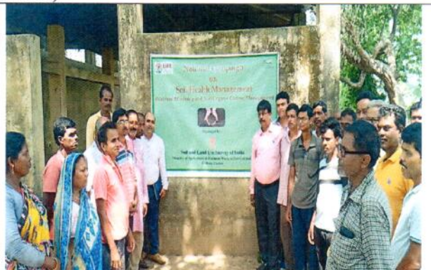
Amkala village, Jhargram district, West Bengal- SLUSI (Kolkata)