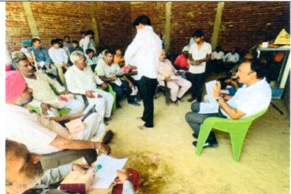
Nalgada village, Bisrakh block, Gautam Budh nagar district, Uttar Pradesh- SLUSI (Noida)