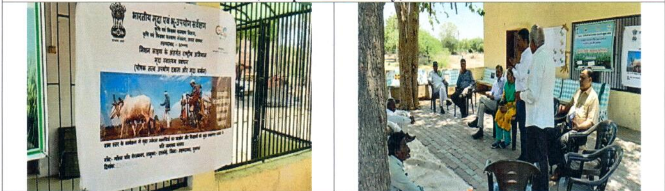
Geratnagar village, Daskroitaluka, Ahmedabad district, Gujarat- SLUSI (Ahmedabad)