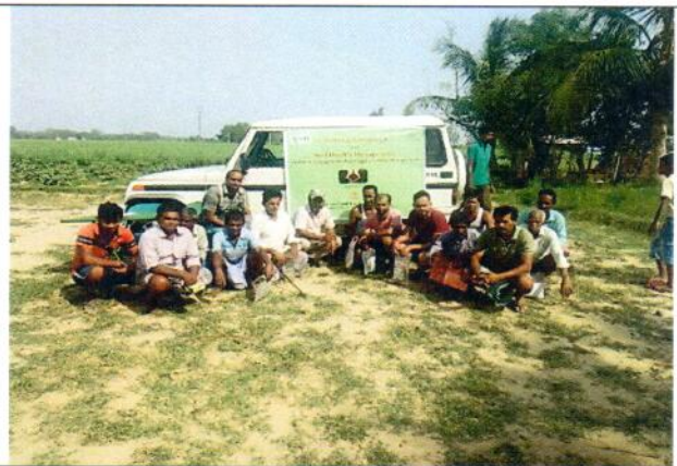
Khirpai village, Paschim Medinipur district, West Bengal- SLUSI (Kolkata)